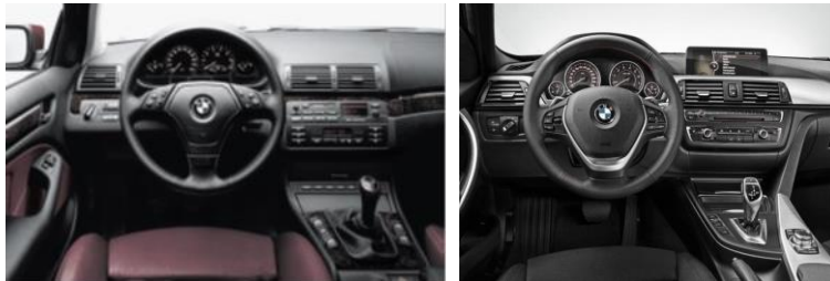
Fig8. The 2000 BMW 325i interior (left) and 2013 BMW 325i interior (right)

Shou yuan (2014) certified that most car manufacturers are making great efforts in designing and promoting In-Vehicle Information System (IVIS), which combines traditional car functions with internet radio, social-networking communication and other forms of internet connection. One of the most compelling illustrations of IVIS is the big screen based navigation system. If you compare two same model cars (BMW 325i) from 2000 and 2013 (Figure 8), you will clearly notice that the biggest difference between the interior of these two cars is an 8-inch LCD display screen - not only for basic GPS-based map navigation, but also to easily access and display driving information (e.g., real-time traffic conditions, weather conditions, and place of interesting).