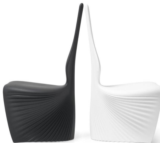
Fig2. Designed by RosLovegrove, use of texture intensifies the form [source: www.designboom.com]