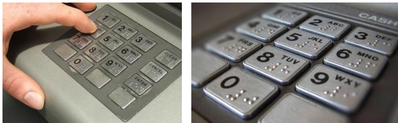
Fig1. Texture applied to ATM for blind person

• Another reason in choosing texture patterns for a product is given personality to it. Deciding on a texture pattern for a product can be carried out in a way that attributes the product to a particular group of people or reminds a specific lifestyle (Figure 2-4).